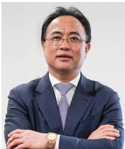
Neak Oknha KITH MENG Chairman